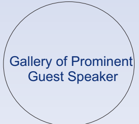
Gallery of Prominent Guest Speaker