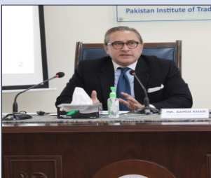
Mr. Aamir Khan